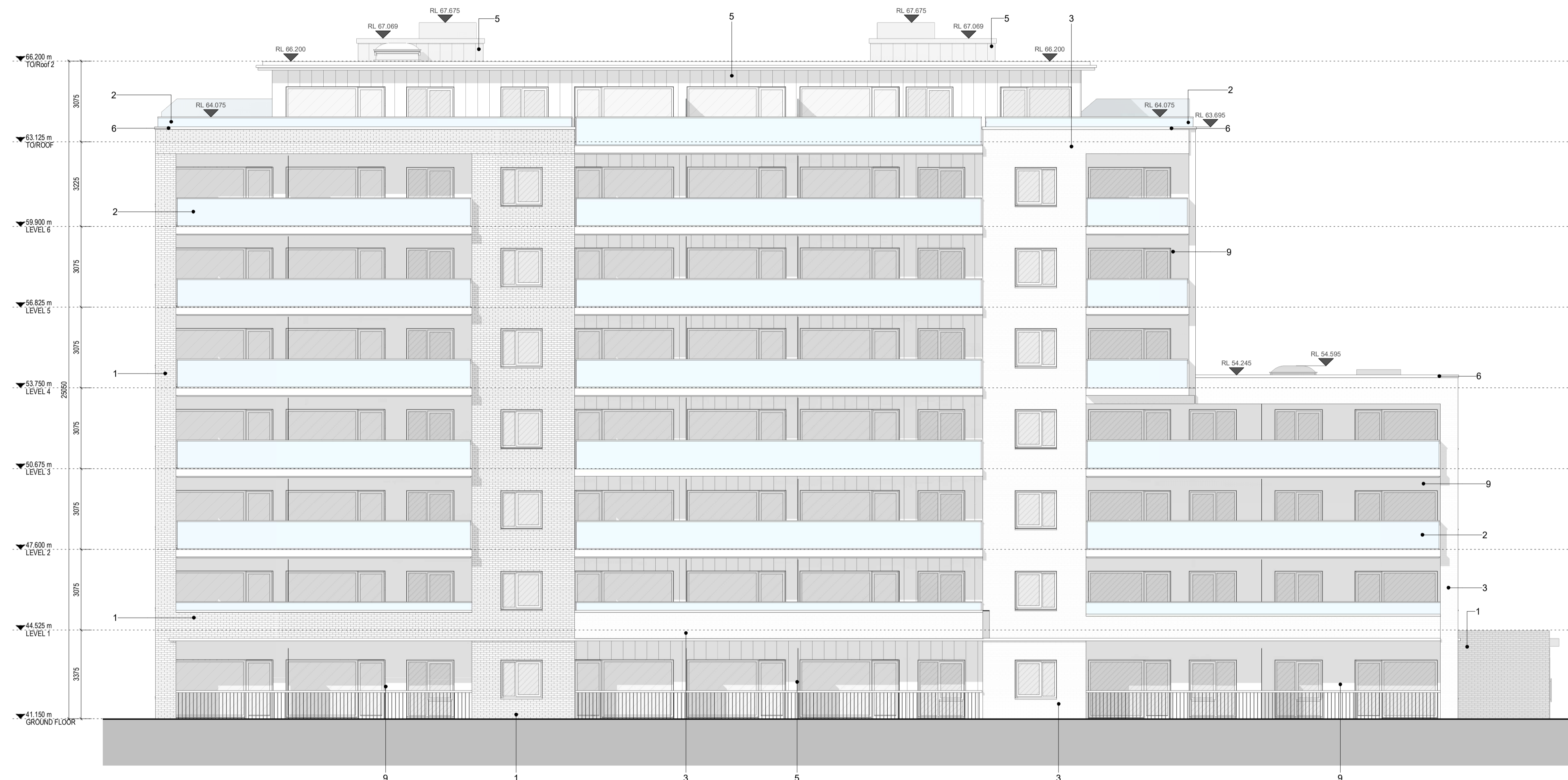
1 GA - West Elevation